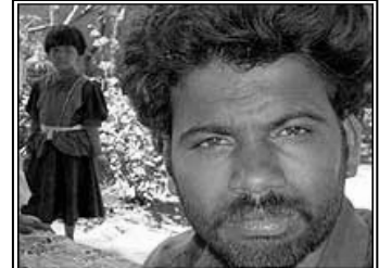
“It’s good that the government is going to offer us work. It’s our only hope.”

2. What do you think: What other things should the government do to help the people in rural areas in India? Give two ideas and give reasons for them. (4)